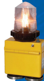
DREDGE-888 Operates 8 months on 2 Alkaline Batteries